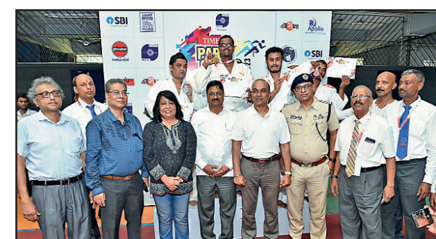
●● Award ceremony with dignitaries