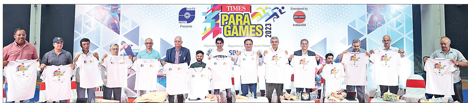
●● Dignitaries and renowned para athletes at the grand opening of Times Para Games 2023 on June 23 at Sports Authority of India Complex in Salt Lake