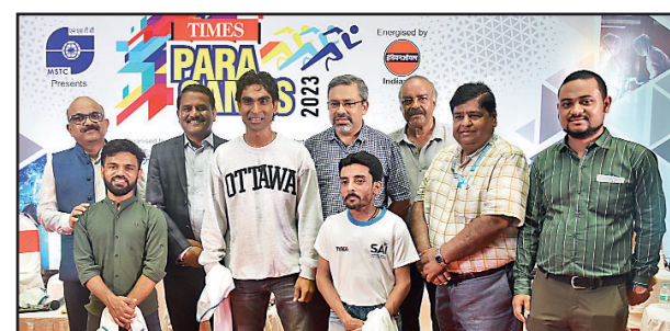
●● Team DVC get up close with the guest para athletes