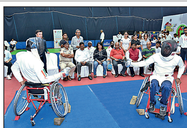
●● Wheelchair bound Fencing Duel