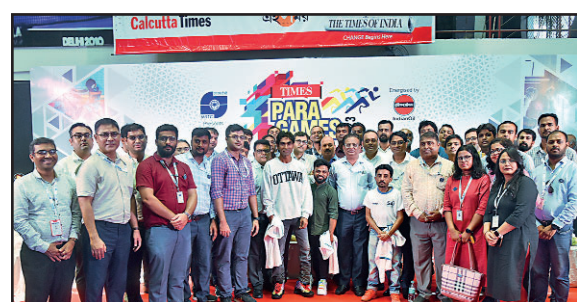
●● Team MSTC with the star para athletes