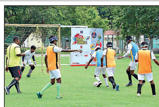
●● Game of Blind Football