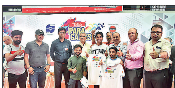
●● Team IOCL ER Pipelines Division pose with the star para athletes