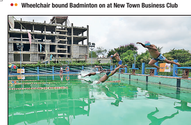
●● Para swimmers in action