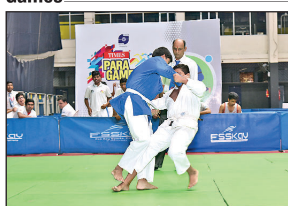
●● A glimpse of a Blind Judo bout