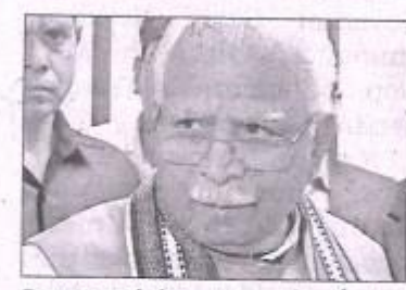
Power minister Manohar Lal

DVC functions under the Union power ministry. Established in 1948, it is an integrated power major spread across a command area of 24,235 sq km in West Bengal and Jharkhand.